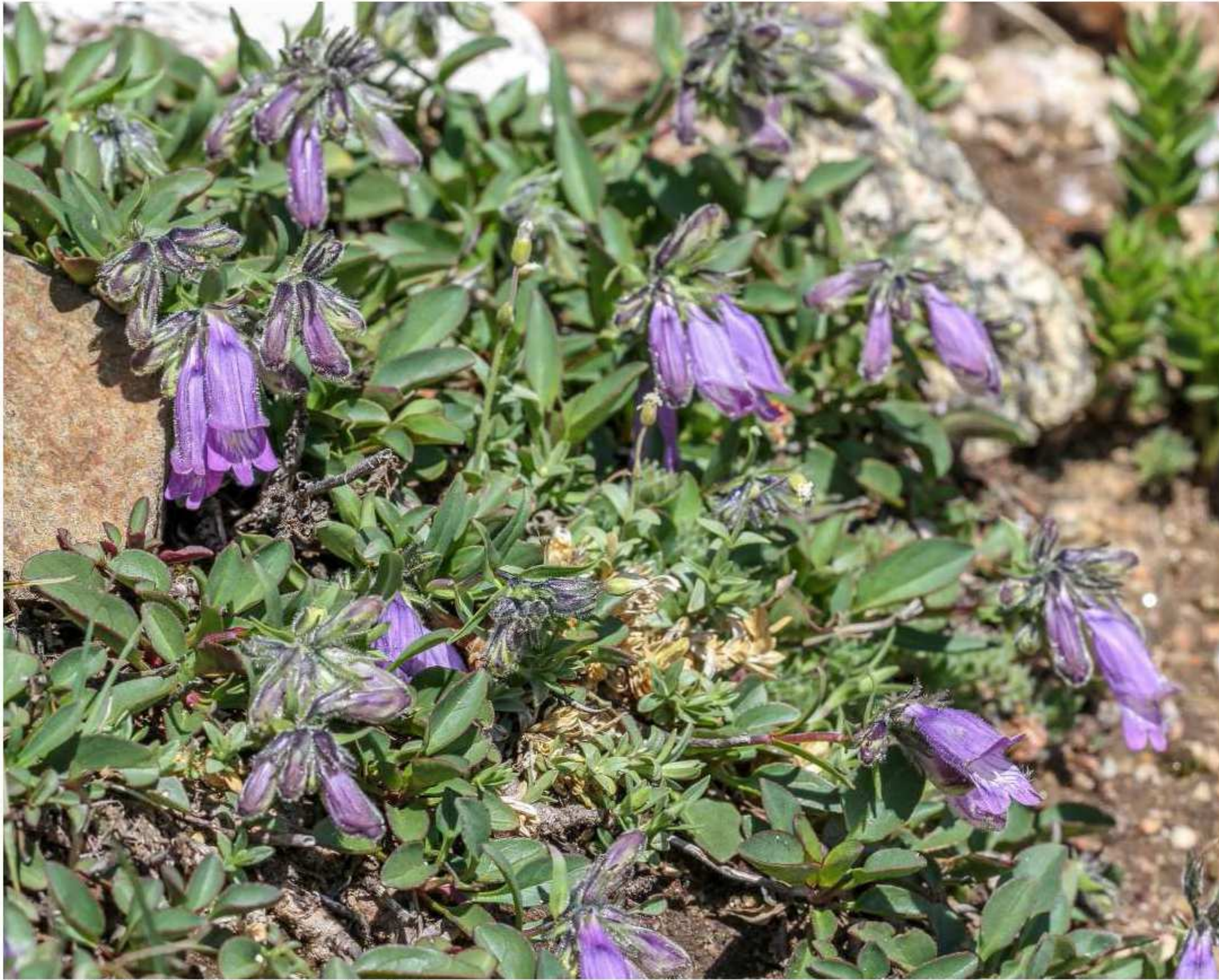
Figure 1. Habit of Penstemon bleaklyi .

Paratypes. USA. New Mexico. Taos Co.: Vermejo Park, ca. 2 mi S of State Line Peak along boundary between Vermejo Park and Rio Costilla, 36.95681° N, 105.3209° W, 12,566 ft. elev, 18 Jul 2012, Heil, Hyder, and Martinez 34213 (SJNM); Rio Costilla Land Grant, Culebra Range, crest of ridge on S side of an unnamed cirque, 2.2 air mi NNW of Big Costilla Peak and 3.3 air mi SSW of State Line Peak, 36.95158° N, 105.3183° W, 12,620 ft. elev, 19 Jul 2012, Heil, Hyder, and Martinez 34276 (SJNM).